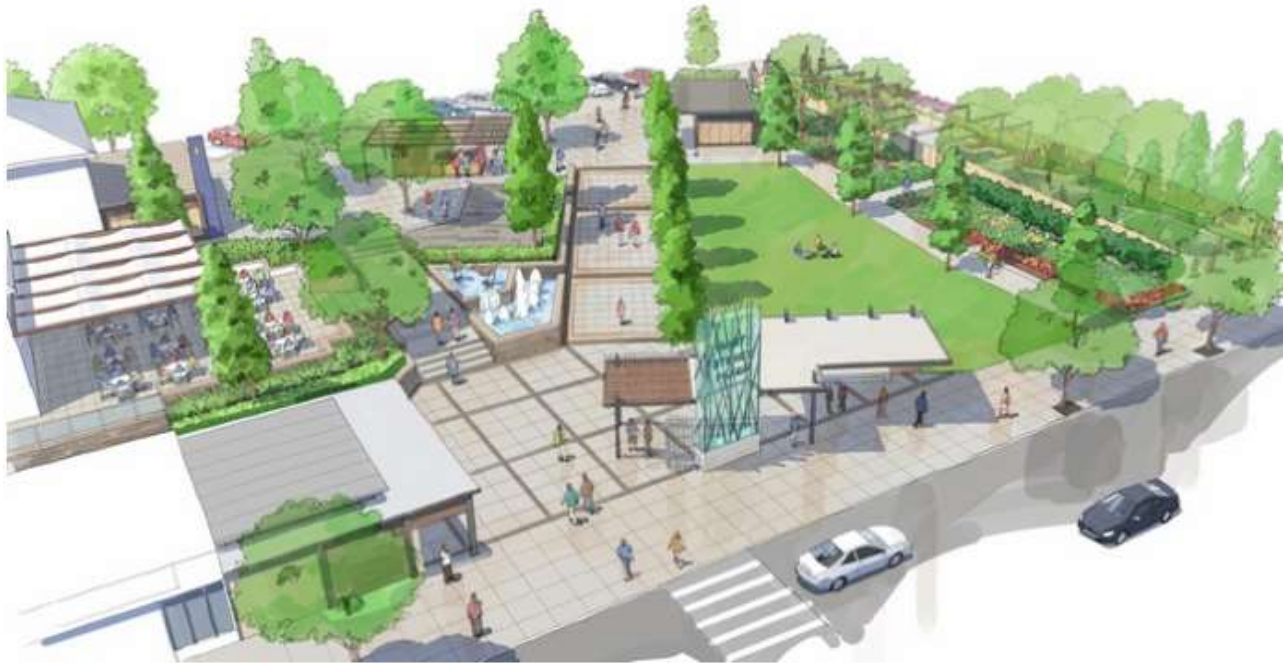
Artists impression of Mary Street Pedestrian Plaza, Gympie

PO Box 72 Highfields QLD 4352 Email secretary@hdbc.org.au ABN 27 560 784 104 www.hdbc.org.au